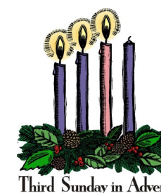
Third Sunday in Advent