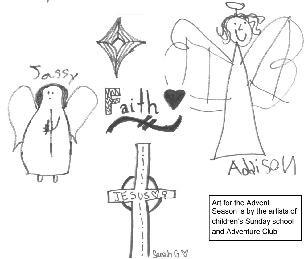
Art for the Advent Season is by the artists of children's Sunday school and Adventure Club