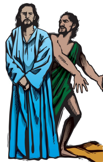
Jesus Is Tempted