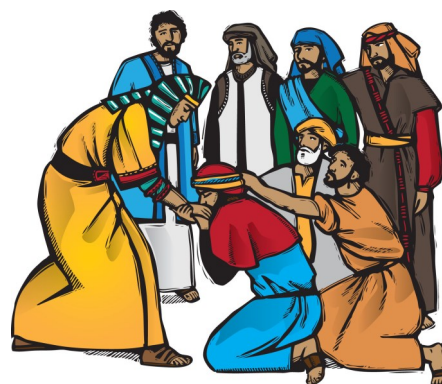
Joseph Forgives His Brothers