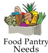
Food Pantry Needs