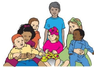
Nursery Worker Wanted

Responsibilities include teaching and supervision of young children (toddlers through 5 years) during bell choir rehearsal, Sunday School, and worship on Sunday mornings: 9:00 a.m. until 12:30 p.m. Compensation is negotiable depending upon the level of experience of the candidate. Please direct interested candidates to contact the church office or send resumes to info@fpcov.org .