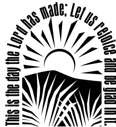
Psalm 118:24, NRSV