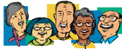
Fun for the Saints