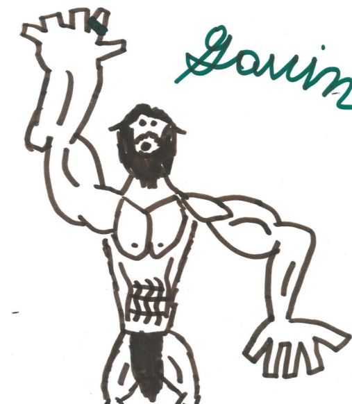
Depictions of John the Baptist by the artists of FPC Church School and Adventure Club