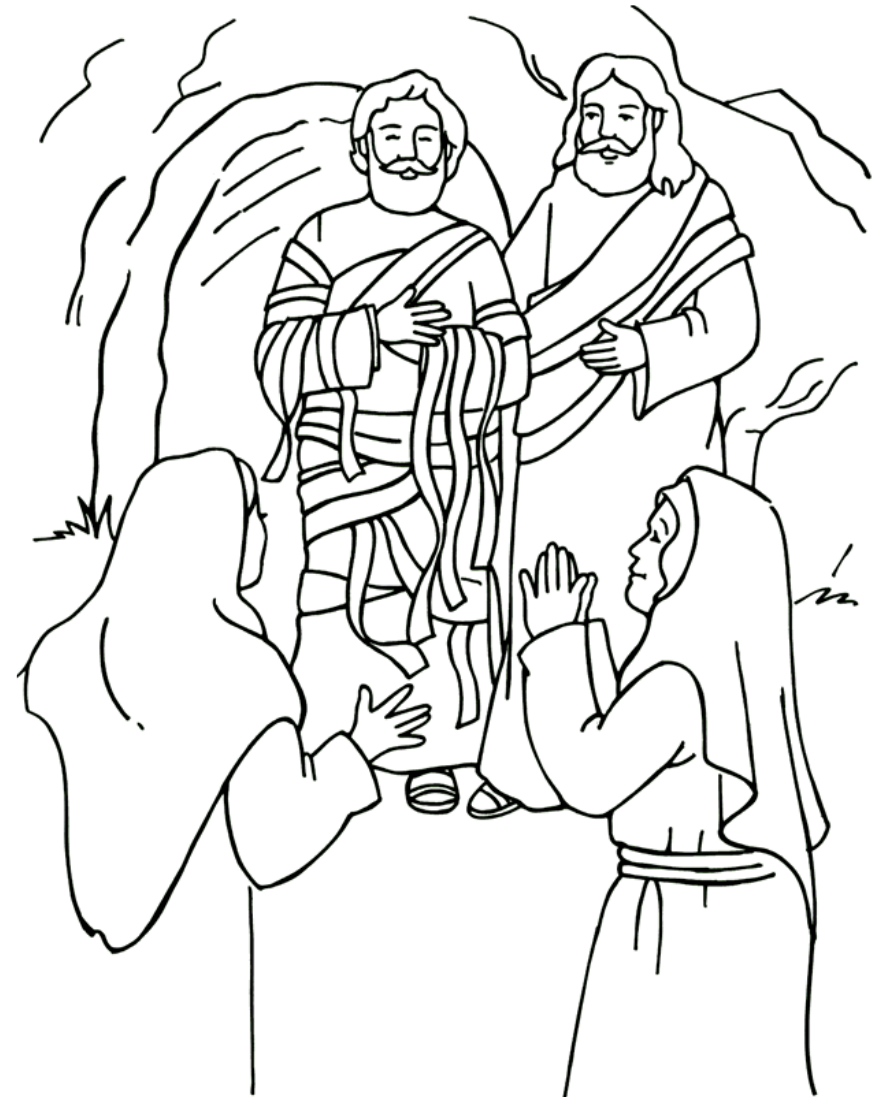
Jesus Raises Lazarus