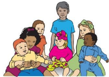
Nursery Worker Wanted