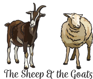
The Sheep & the Goats

On July 8th, we sent quarterly statements to those who have email via email. It would have been delivered as a link to your Realm statement from First Presbyterian Church. (If we have your correct email address.) Those who don't have email will have a printed statement in a basket in the narthex. If you didn't receive your statement via email, you may call or email the office and one will be printed for you.