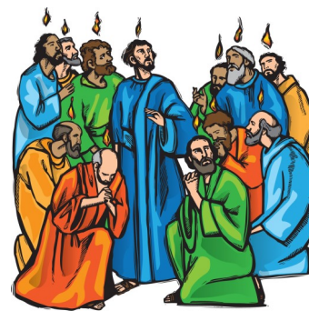
The Holy Spirit Descends on Pentecost