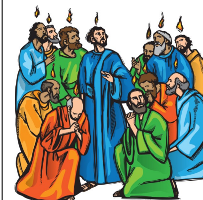
The Holy Spirit Descends on Pentecost