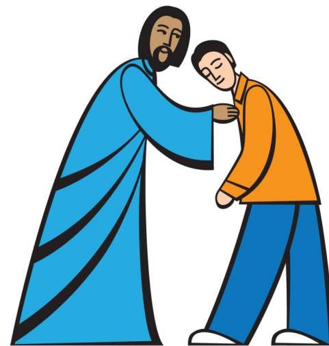
Healed by Faith