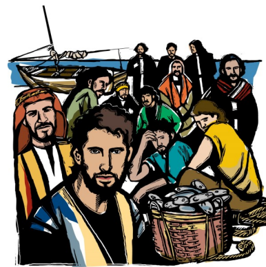
The Twelve DISCIPLES